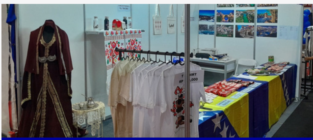
Diplomatic Bazaar in Jakarta