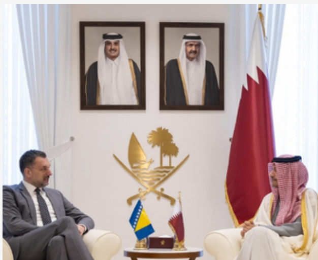
Meeting in Qatar