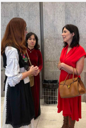
Diplomatic Bazaar in Prague