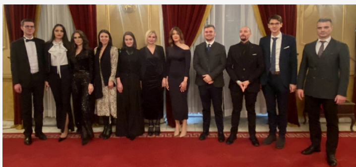
Concert at the National Theater

This event marked a significant milestone for the Young Diplomats Club, providing a platform for meaningful dialogue and collaboration. The Club aims to create opportunities for young professionals in diplomacy to exchange ideas, build networks, and engage with key stakeholders.