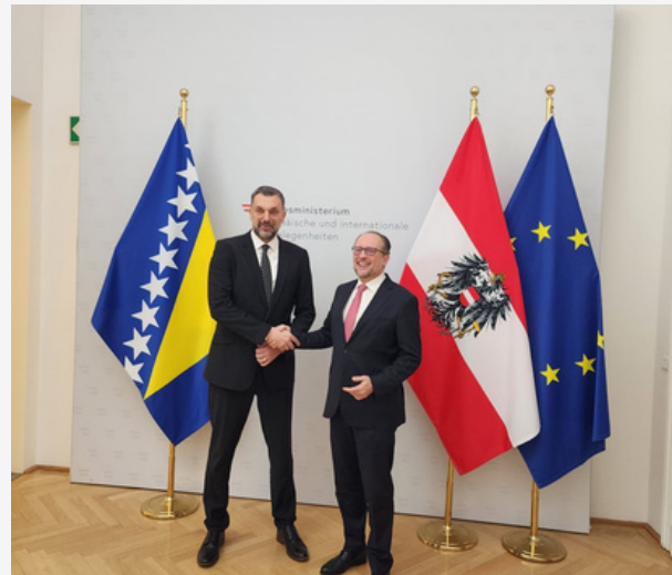
Meeting in Vienna