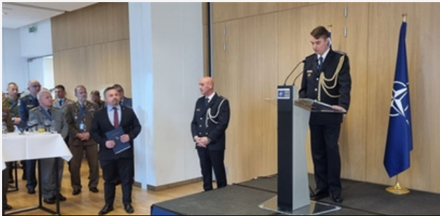
NATO HQ in Brussels

Honouring its accomplishments and reaffirming its commitment to upholding peace and safe future for all of us, the Day of the Armed Forces of Bosnia and Herzegovina was also celebrated in our diplomatic offices in Washington, New York, Brussels, Berlin, Vienna, London, Belgrade and many more, worldwide.