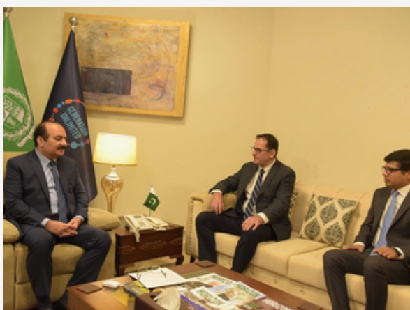
Meeting in Pakistan