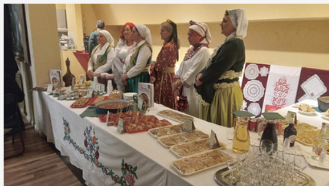
Promotional evening of the Una National Park