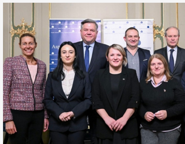
ASPEN Working Group Meeting in Berlin