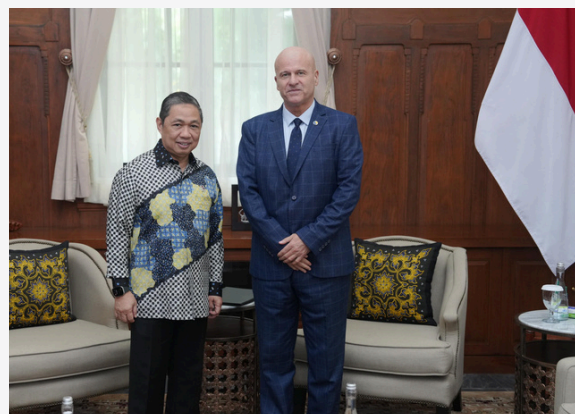
Meeting in Indonesia

The Deputy Minister pointed out that Indonesia supports the European path of Bosnia and Herzegovina and expressed his satisfaction with the good bilateral relations between the two friendly countries.