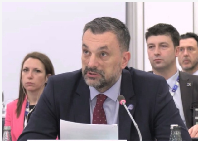
Bosnia and Herzegovina