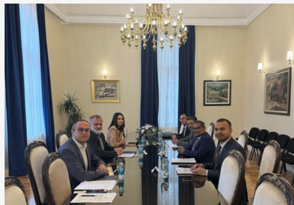
Meeting in BiH