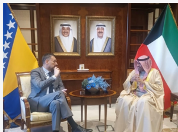
Meeting in Kuwait