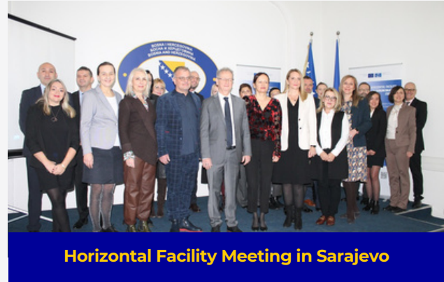
Horizontal Facility Meeting in Sarajevo