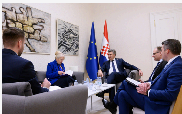
Meeting in Croatia