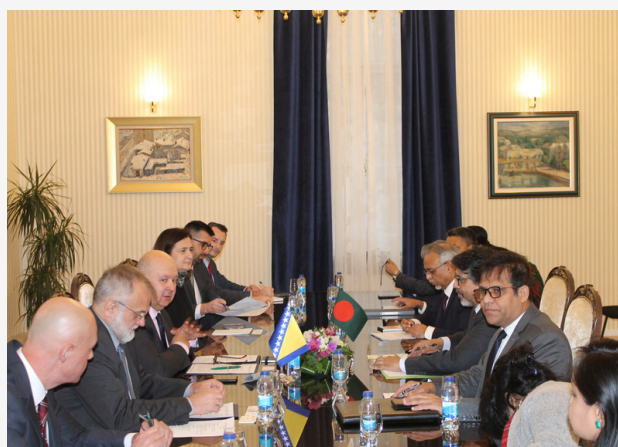
Meeting in BiH